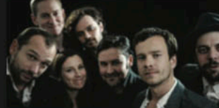
Saturday 8 July / 7.30pm

Apple of My Eye are the strongest contenders left under the microscope. Their music blends traditional English folk and modern song writing, using vocal harmonies and traditional instruments. They play regularly around London and are fast becoming a regular highlight of the folk scene including South Green, Whitmore and localities such as Eborac and Eke Hall.