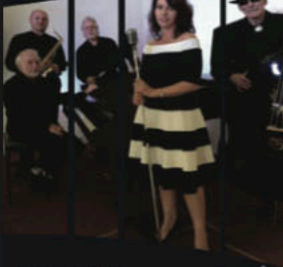
The HopBarn centre for music and creative performance

The HopYards present an evening of classic and popular blues, roots & jazz