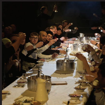
Counting Sheep - Staging a Revolution