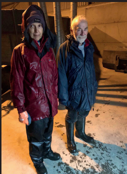
The HopBarn Directors after trying to save the farm's grain store (below) from flooding - December 2019

We hope that despite the problems with the weather, no one was left in any serious predicament and managed to dry off relatively quickly. The farm land however will take much longer. Despite battling with the elements, our programmed events in December went ahead and again brought some much needed excitement to what was in essence a wet and dismal period.