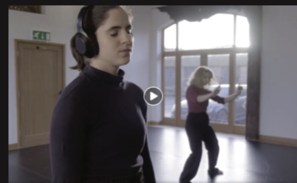
Video still of Era We Are

This is a short piece of work although there has clearly been a lot of thought and effort in ensuring that it stands alone as a finished piece of work.