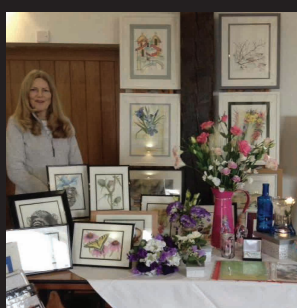
Ross Reese Watercolours