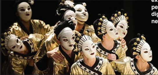
Dancers from The Royal Opera Production Turandot