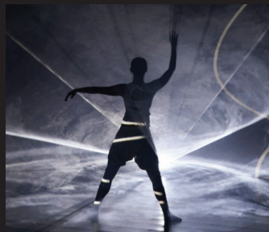
TDC - Infinite 2018

Step Sonic will be showcased at DEDA, Derby on the 17th and 18th October following TDC's residency at The HopBarn.