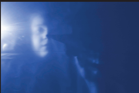
Me and My Whale - Plastic Drowning

Other experiments included singing with underwater microphones, lighting our bodies through water and plastic, using live spectral domain processing to make a bowl of water sound like a submarine and starting to build a vocabulary for aquatic communication using voice, movement and technology.